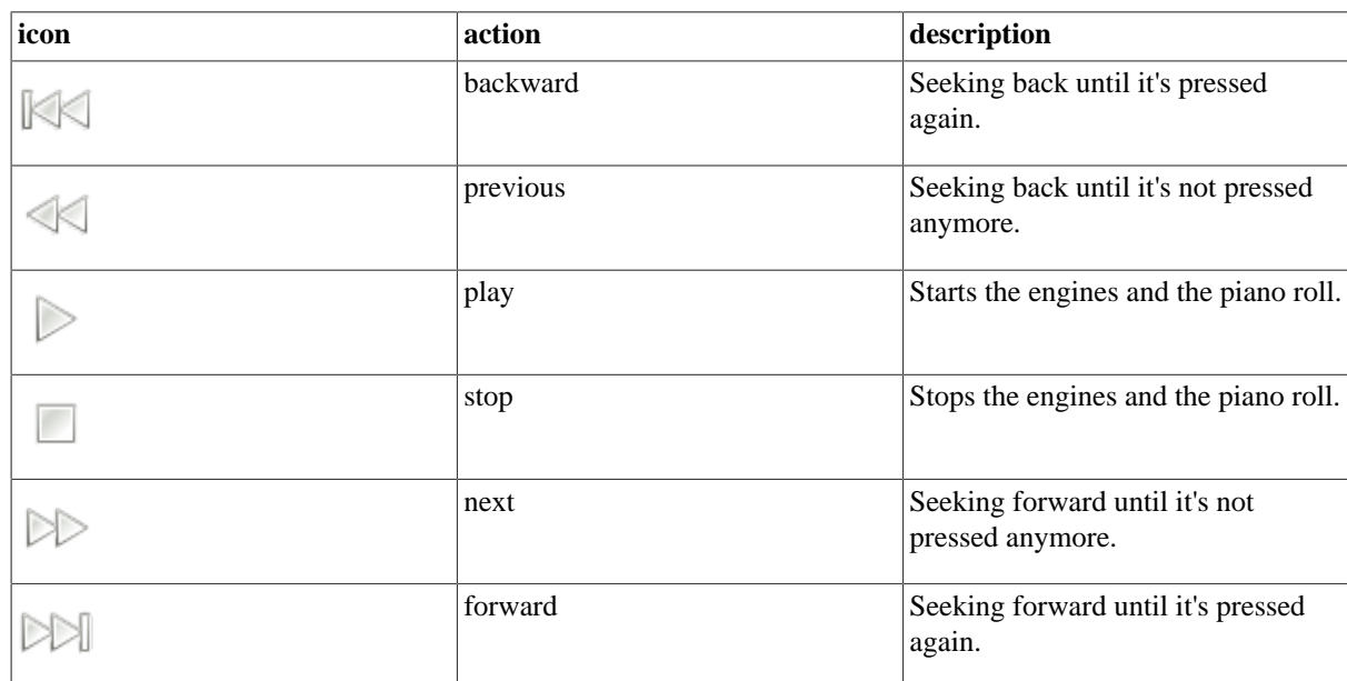
Table 4.1. AGS playback controls table

The loop checkbox enables the loop L and loop R settings below. It causes the notation to loop playback. Auto-Scroll checkbox animates the horizontal scrollbars to follow playback position. Use exclude sequencers checkbox to enable/disable pattern based sequencers.